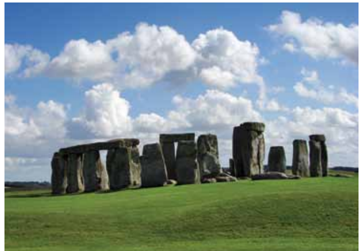
Stonehenge in Wiltshire.