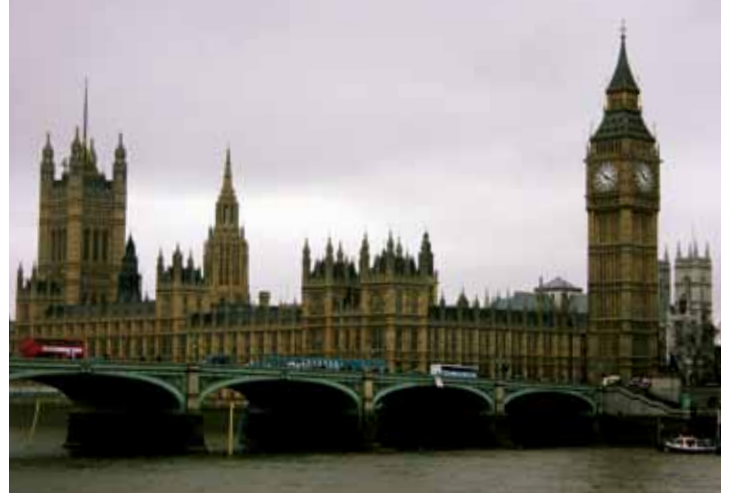
The Houses of Parliament in London.