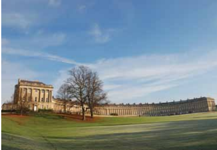
The Royal Crescent in Bath, Somerset.