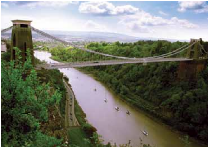
Clifton Suspension Bridge in Bristol, Somerset.